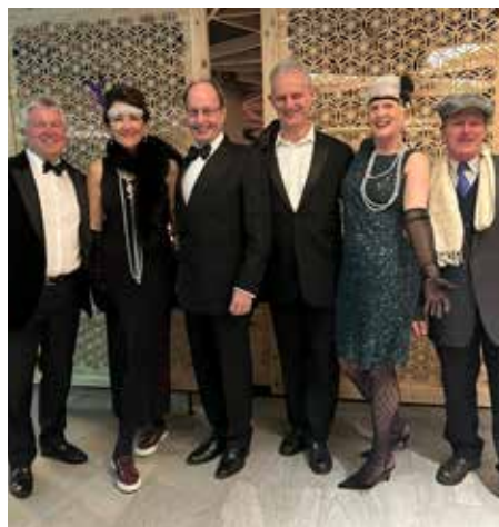
20's style end party

Next season the AICC races are in Klosters from 20th to 22nd March 2025 where our hosts, Mardens, will again put on a magnificent show. We are quietly confident that our younger men are keen to return, along with a ladies team, so we could be three AVSC teams in 2025. Watch this space!