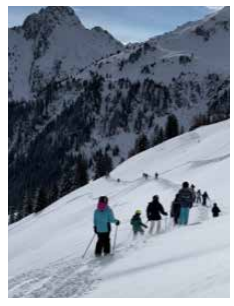
Off piste trek

The usual training schedule ensued, including varied techniques; pole