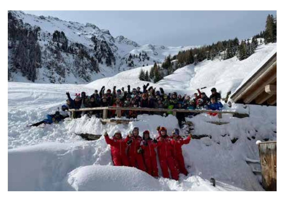
Half Term Group

Race day turned warm and so the course was rather soft and became a little rutted. We had a proper race by the Inneralpbach T-Bar. And just to keep bragging a little, there aren't many ski schools that offer