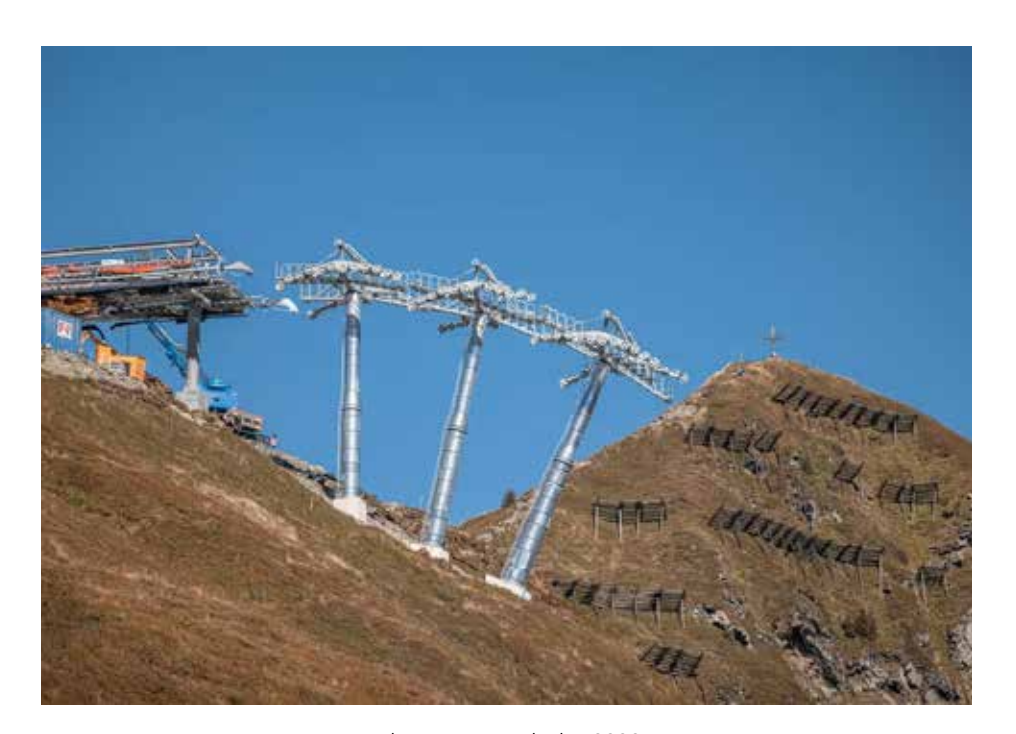
The New Hornbahn 2000

Lift Closures Wildschönau 10 April Alpbach 16 April