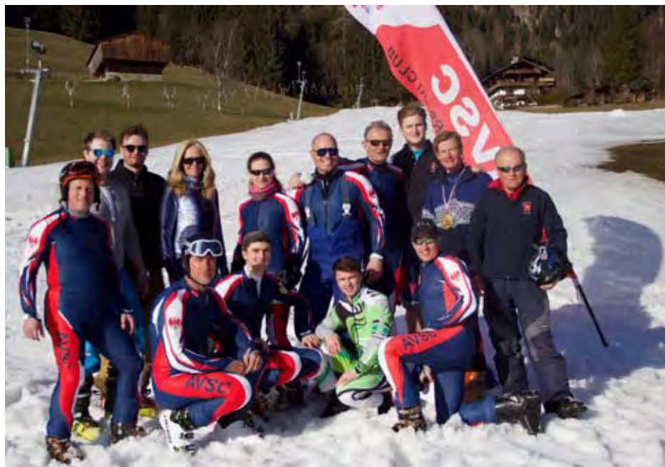
The AVSC teams

So why did my sisters not have similar? We'd skied together since year dot, starting each day at eleven and making lunch at the Hotel Wiedersbergerhorn by one. Part of me felt like I had a secret advantage that would reveal itself in the Super G. That's what these skis were made for, right? The other part felt like I had bitten off more than I could chew. Perhaps it was being told that I could exchange them that made me more determined to make the Blizzard skis work.