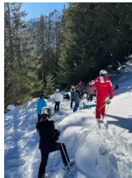
On the Greitalm