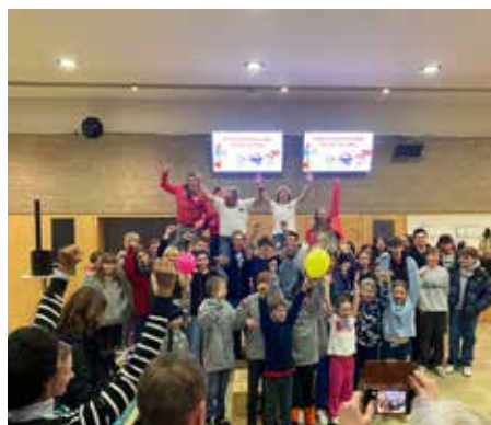
The Half Term crew

The almost perfect conditions were too good to last the whole of Half Term and, sure enough it came to an end on Thursday night. On Friday morning, Race Day, instead of our usual sub zero starts, the temperature was a balmy 4°C. Inneralpbach conditions were difficult with a soft and slow race track, causing more falls and errors than we would normally expect. Every year we see smiling faces in the gate and watch all the children giving the race their best shot. Team Gerhard, with extra help from the Ski School, kept the track raceable for the Class races and then made a major sweep to prepare the track for 45 Open Race entrants